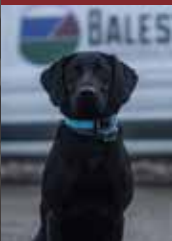
COMPANY MASCOT: RIPLEY